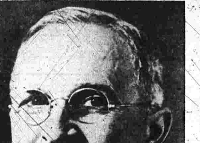
RESEARCHER long-held Truman attain fame as prober when elected to Senate 1934. Started political career in 1922.