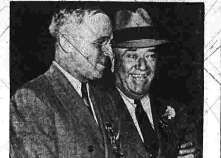
TOMMY Pendergast, right, Missouri "boss," paved Truman's political road. They're shown together at 1936 Dem. convention.