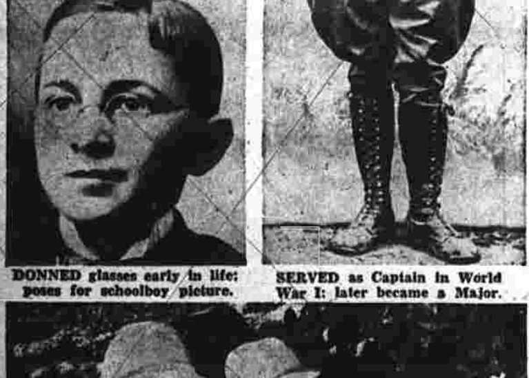
DOWNED planes early in life; served as Captain in World War I. Later became a Major.