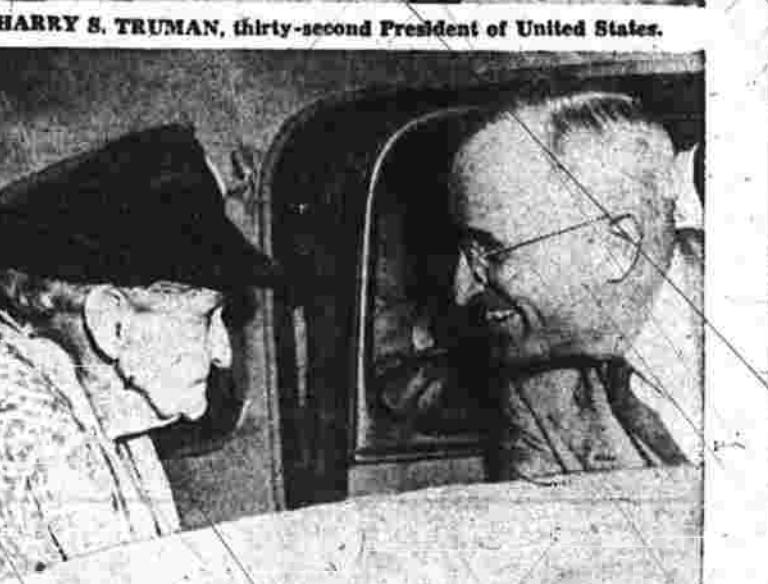
MOTHER Martha E. Truman knew fully her son's climb up the political ladder. Her, they chat at a National Convention.