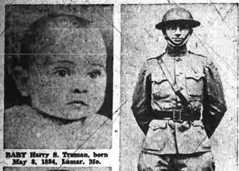
BABY Harry S. Truman, born May 8, 1884, Lamar, Mo.