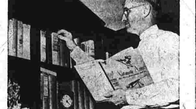
RESEARCHER long-held Truman attain fame as prober when elected to Senate 1934. Started political career in 1922.