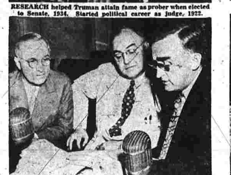
TRUMAN, Kilgore and O'Mahoney—they investigated the war effort. It was then that Truman caught nation's fancy.